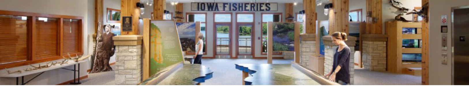
Allamakee County Conservation Board / Main Street Studios