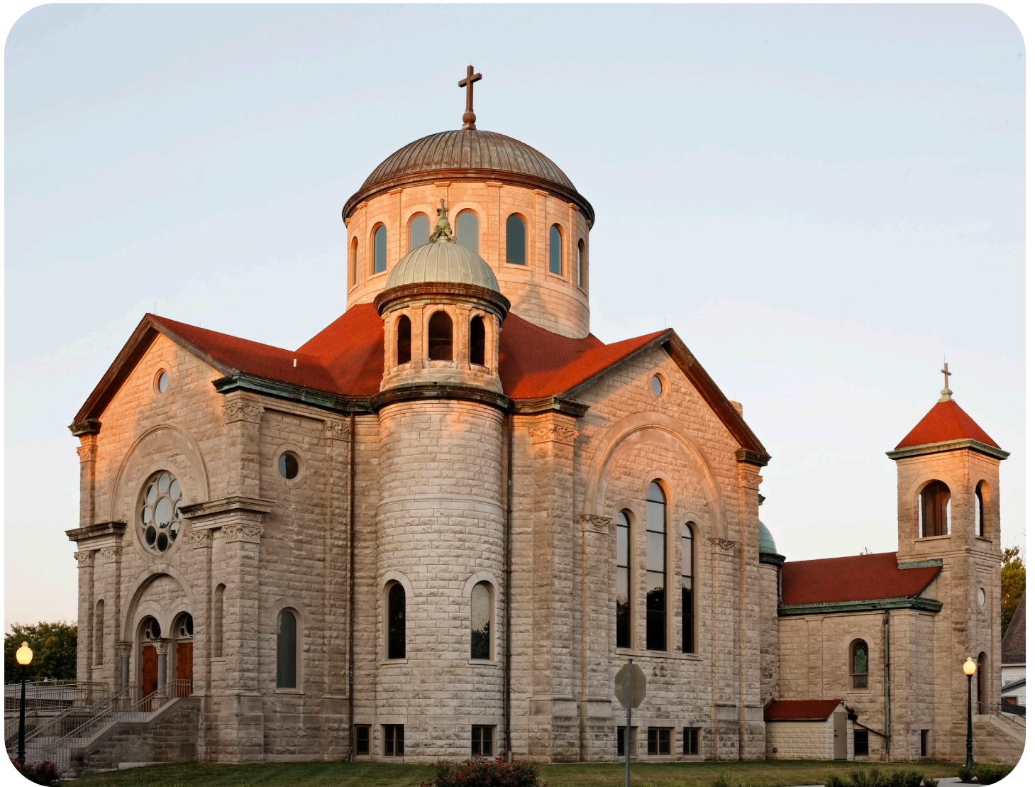
Saints Center for Culture and the Arts

Dallas, Adair and Guthrie Counties in Southwest Iowa