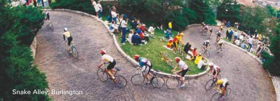
Snake Alley, Burlington