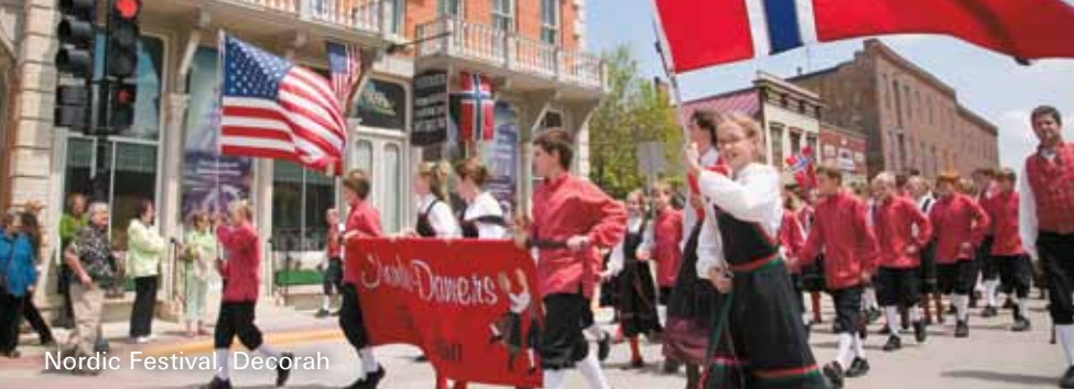
Nordic Festival, Decorah