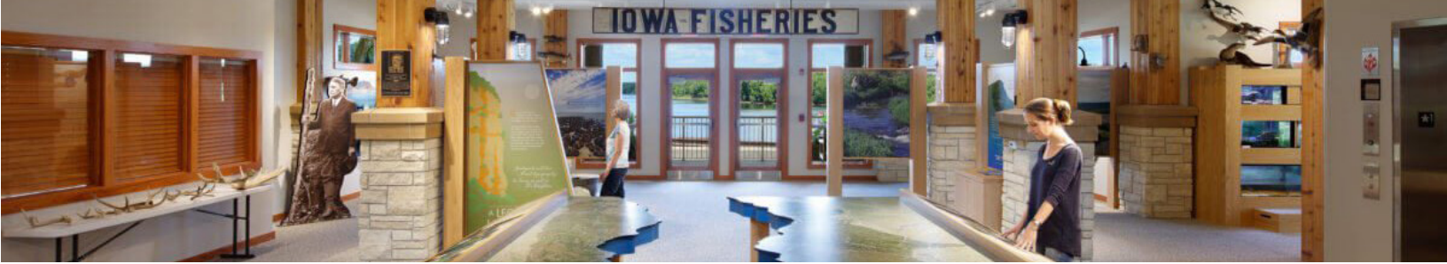
Allamakee County Conservation Board / Main Street Studios