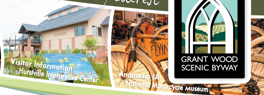
Visitor Information Hurstville Interpretive Center