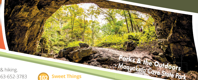
Parks & the Outdoors Maquoketa Cave State Park